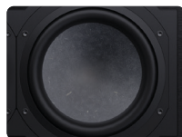
HPF - Hybrid Pulp Formulation Diaphragms made from mixed long fiber hardwood, bamboo and wool