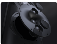
DPC-Array Directivity pattern control *USA Patent pending